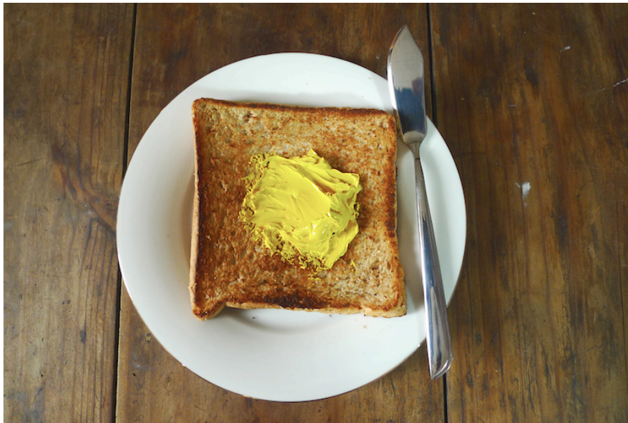
Lyle Buencamino, Death of the Last Romantic , bread, oil paint, white plate and butter knife, 2012