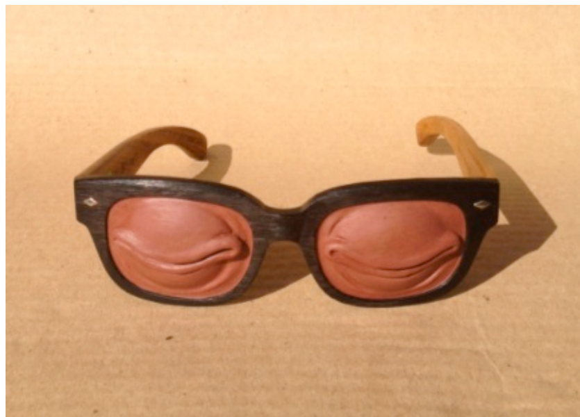
Uji Handoko Eko Saputro, As Easy as Adding the Values , optic frame and polyester resin, 14 x 13 x 5 cm, 2012