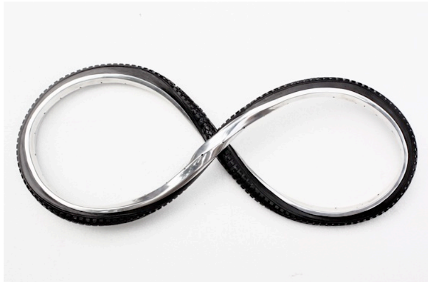
S. Teddy D, 8, aluminum and fiber, 80 x 35 x 12 cm, 2012