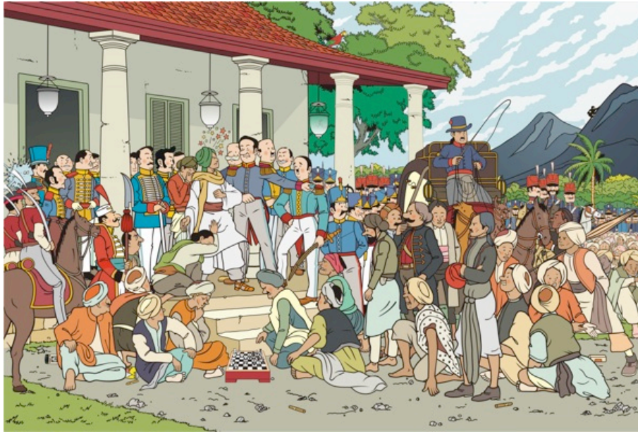
Indieguerillas, This Hegemony Life , digital print on canvas, dimensions variable, 2012