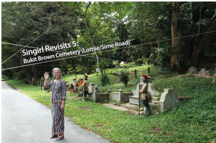
Amanda Heng, Singirl Revisits Postcards , set of 8 postcards with a designed holder, Postcards 14.6 x 9.6 cm, holders 22.2 x 25.7 cm, 2012