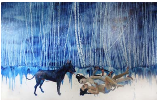
Entang Wiharso Rejected Landscape, 2012 Oil on canvas 285 x 500 cm | 112.2 x 196.85 in

Booth Nr. C01-04 , January 23rd to January 27 th 2013