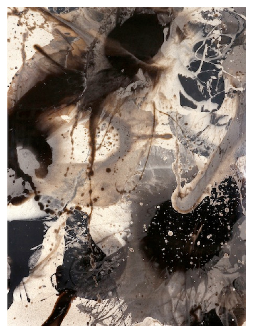
Arin Dwihartanto, Merapi Volcanic Ash Series 7 , pigmented resin, merapi volcanic ash mounted on wood, 136.5 x 180.5 cm, 2012