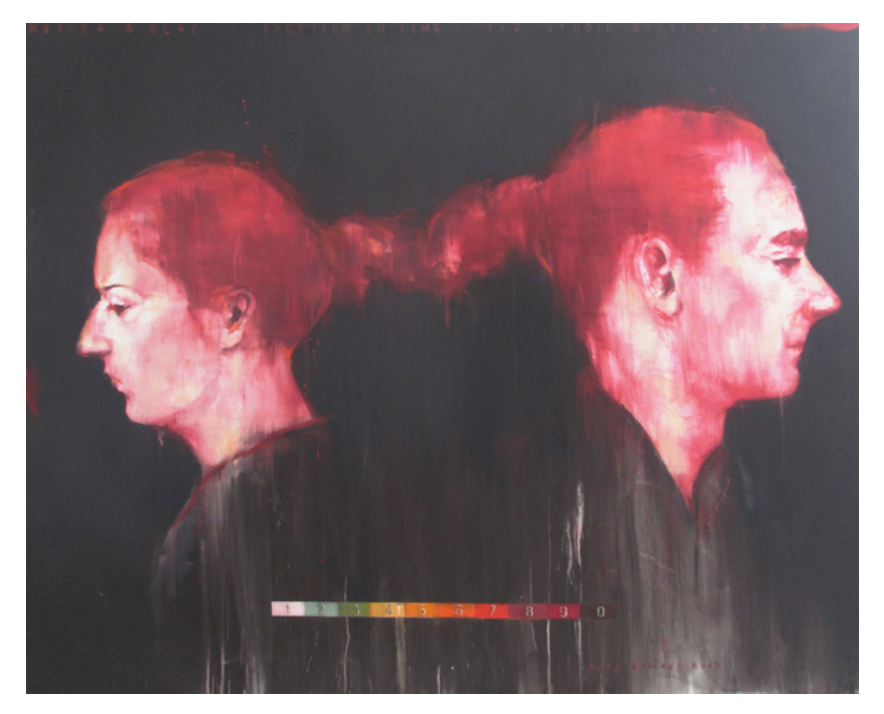
Agus Suwage, Relation in Time, oil and acrylic on canvas, 150 x 120 cm, 2012