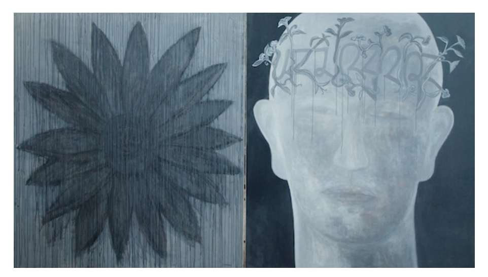
Arahmaiani, Sonam, acrylic on canvas, 200 x 360 cm diptych, 2012