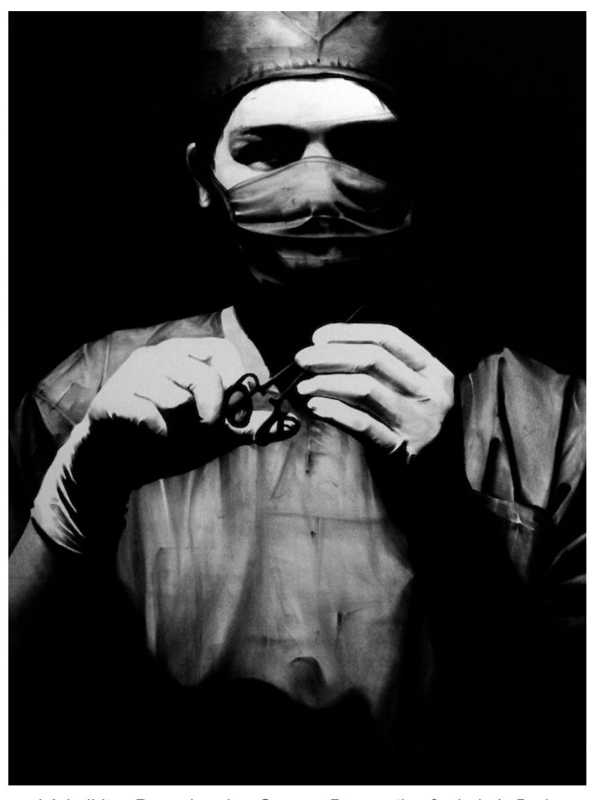
J Ariadhitya Pramuhendra, Surgery Preparation for Luke's Body, charcoal on canvas, 150 x 200 cm, 2012.