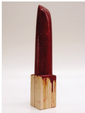
Rouge Chicago 2009 Wood, paint, enamel, varnish H45 x W9 x D9 cm

Note: Images are not to scale. High-resolution images are available upon request.