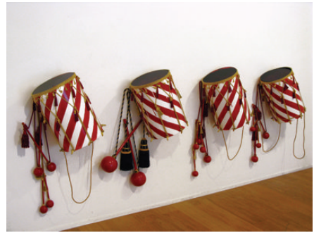
Rhythm Is My Only Companion 2009 Wood, enamel paint, tassels, ropes ø 35 x H50 cm (each)