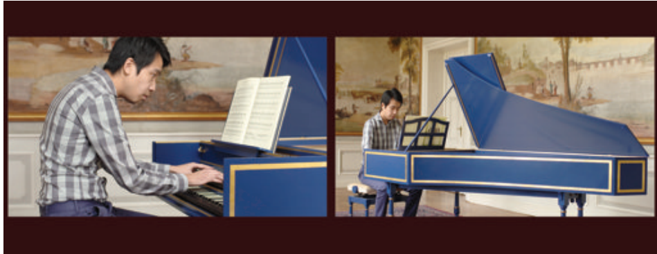
Backwards Bach (video still) 2013 2-channel video (5:20)