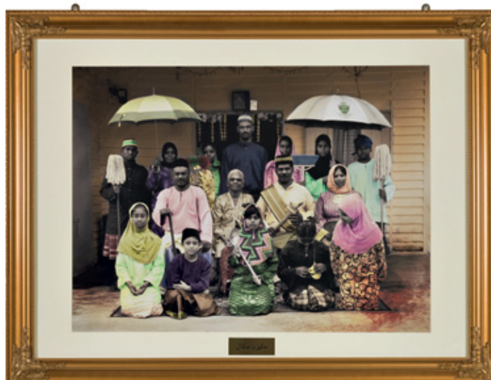
◀ Keeping Up with the Abdullahs II, 2012