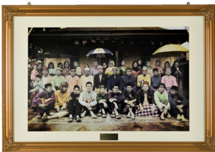
◀ Keeping Up with the Abdullahs I, 2012

While at first glance these photographs may seem to be from an earlier era, they were produced in 2012, and digitally “aged” to look as though they were made long ago.