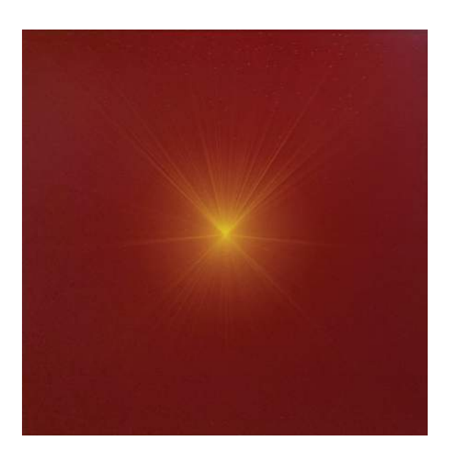
Jeon Byeong Sam, Sapiens: A Brief History of Humankind , 2020 Digital colour print on aluminium (diasec), 150 × 150 cm